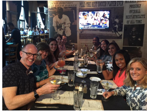
Atlanta ALA having dinner at The News Room