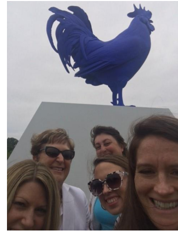
Raleigh ALA 25-foot blue rooster at the Minneapolis Sculpture Garden