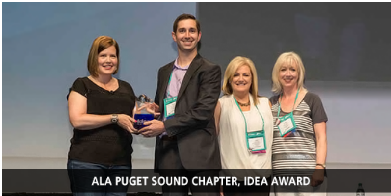
ALA PUGET SOUND CHAPTER, IDEA AWARD