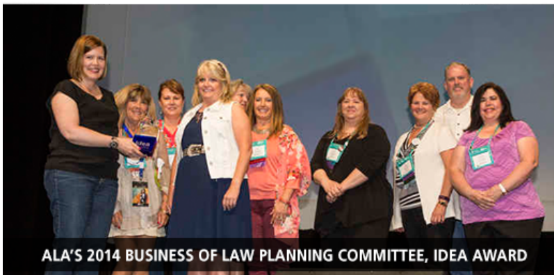
ALA'S 2014 BUSINESS OF LAW PLANNING COMMITTEE, IDEA AWARD