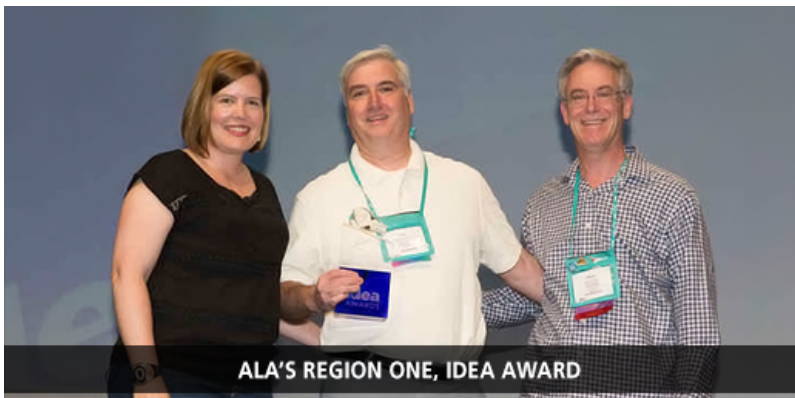
ALA'S REGION ONE, IDEA AWARD