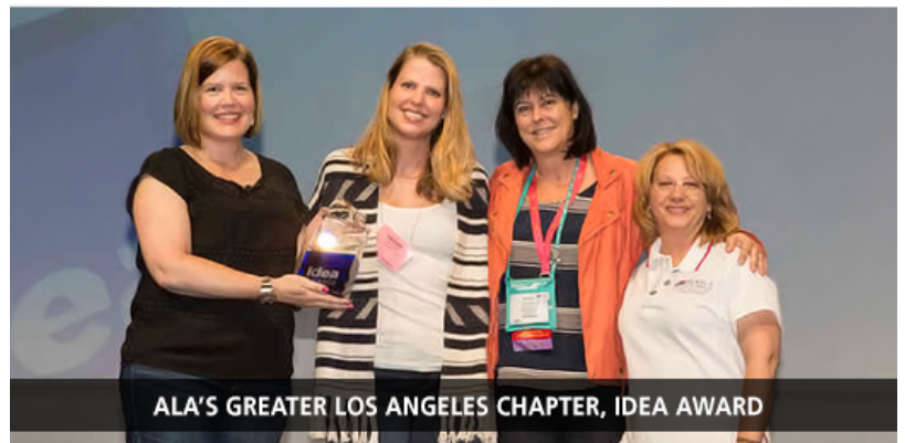
ALA'S GREATER LOS ANGELES CHAPTER, IDEA AWARD