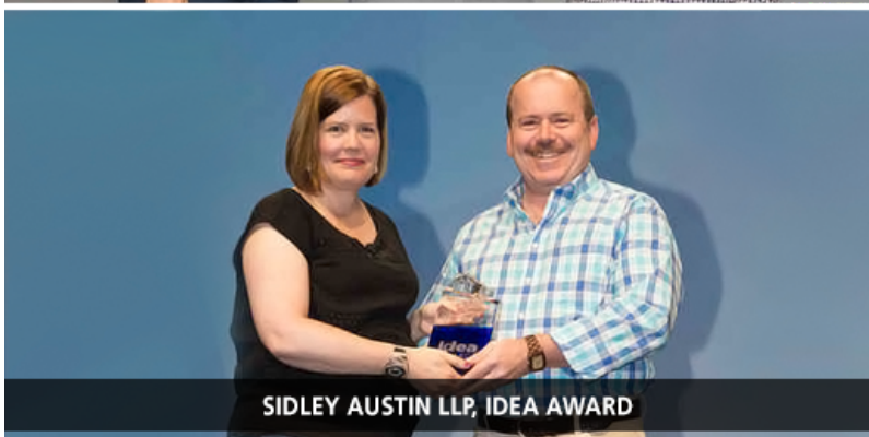
SIDLEY AUSTIN LLP, IDEA AWARD