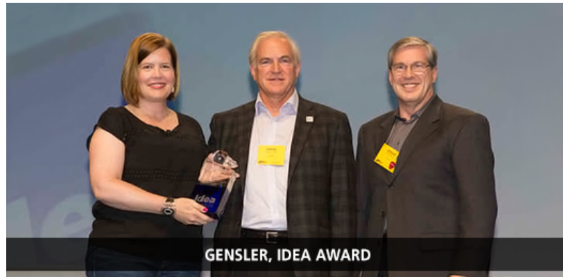
GENSLER, IDEA AWARD