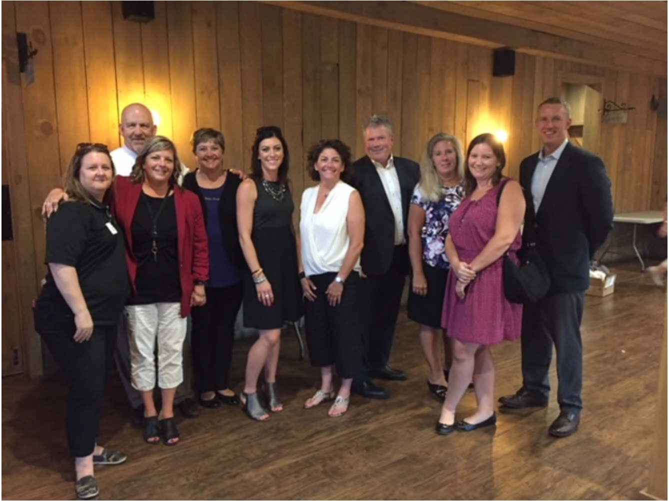
Group photo of WALA members and business partners.