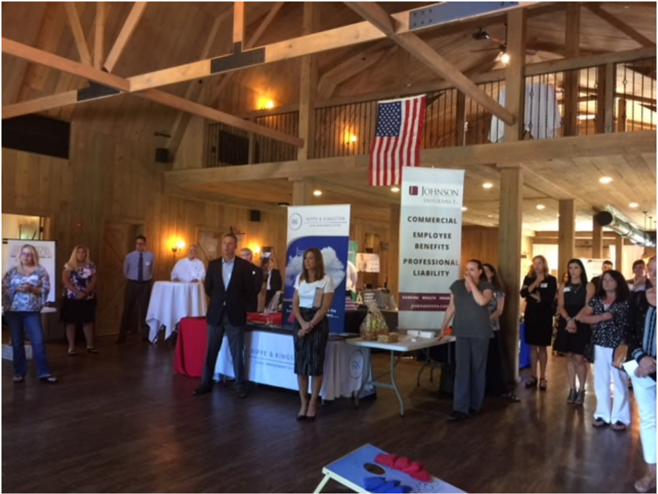
Business Partner displays and booths at the kick-off event.