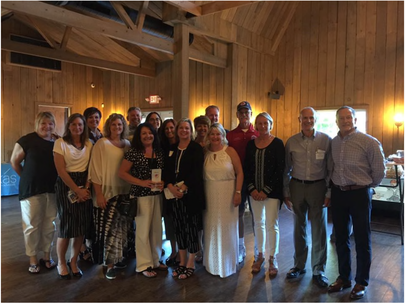
Group photo of WALA members, WALA business partners, and Honor Flight Representatives.